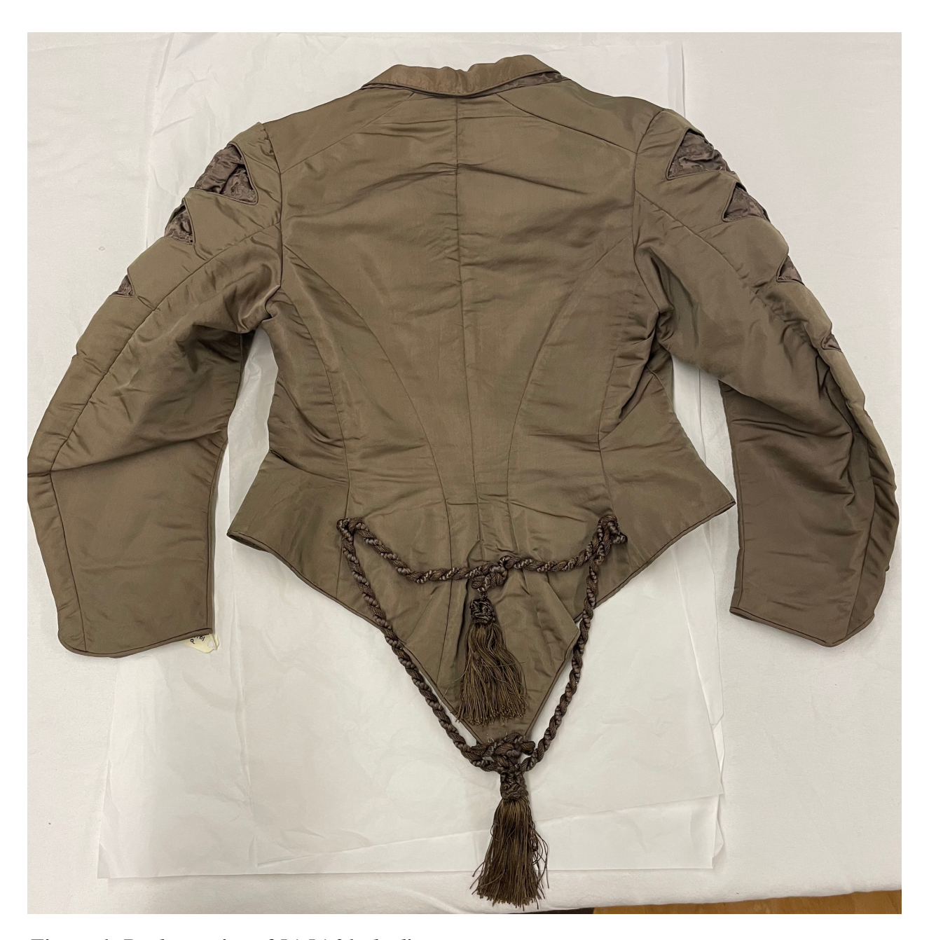
Figure 6: Back exterior of 54.54.01a bodice Notable condition issues pictured include: Slight discoloration at collar