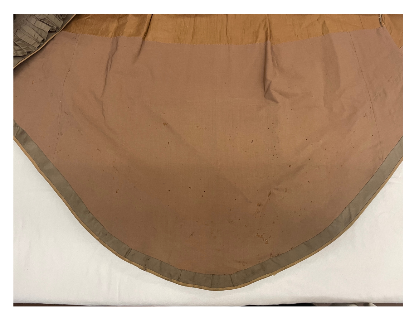
Figure 3: Close up of Rear interior panel of 54.54.01b skirt Notable condition issues pictured include: