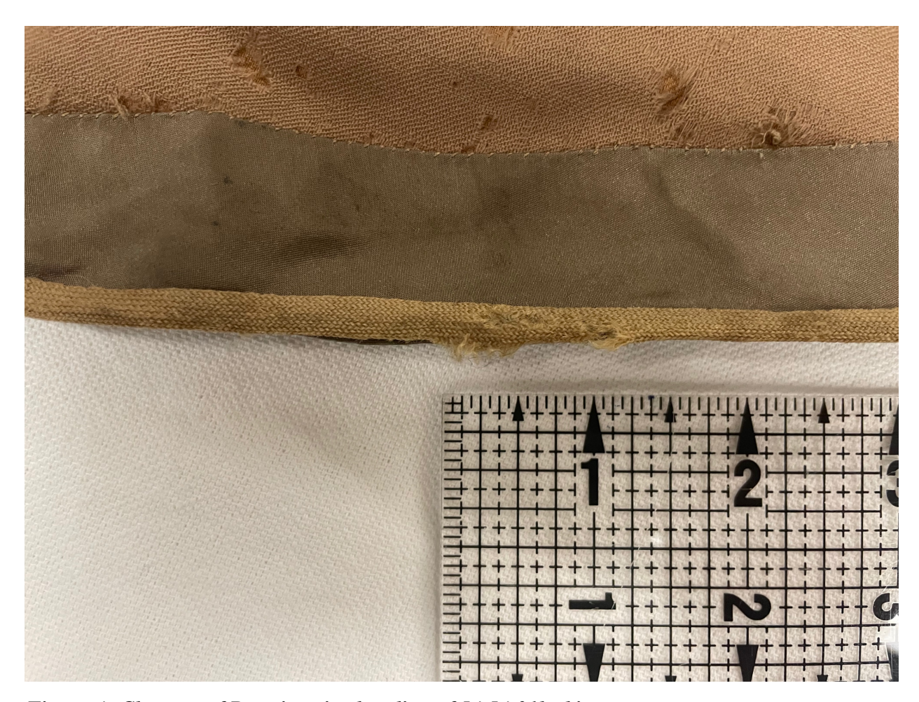
Figure 4: Close up of Rear interior hemline of 54.54.01b skirt Notable condition issues pictured include: