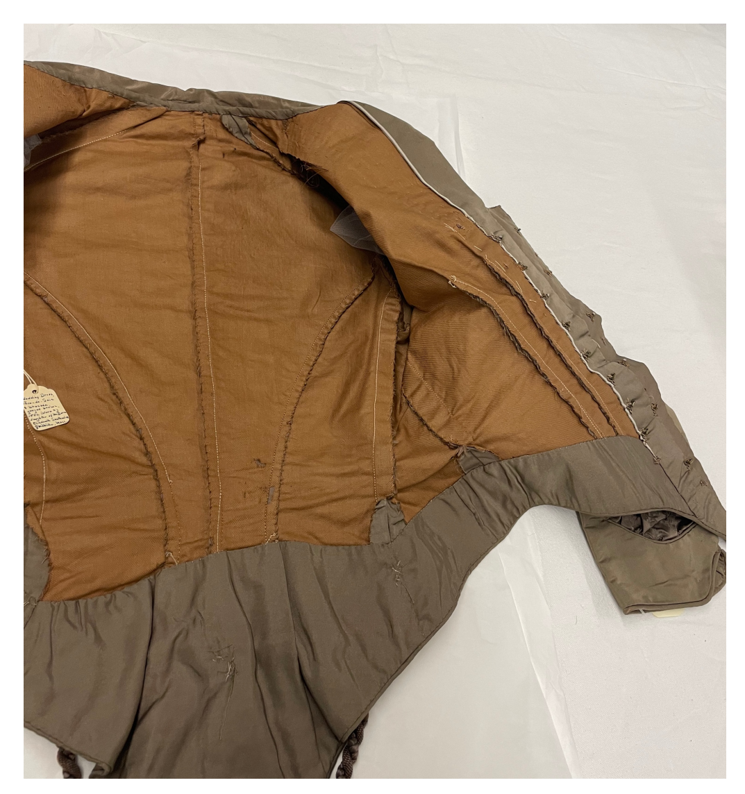
Figure 7: Back interior and proper left front interior of 54.54.01a bodice Notable condition issues pictured include: