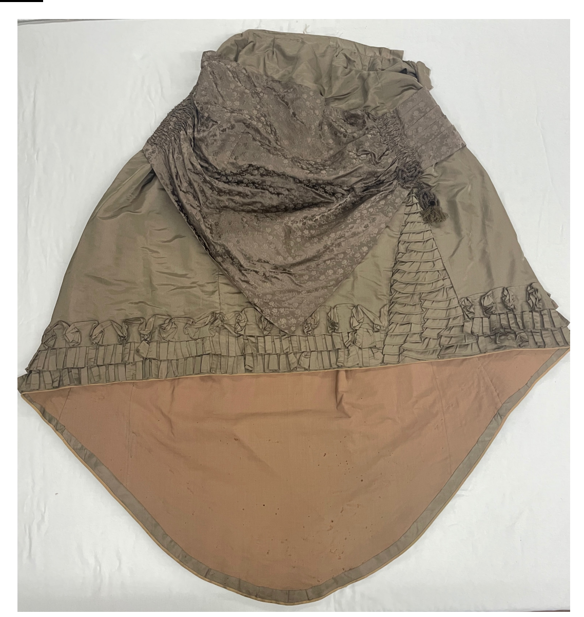
Figure 1: Front Exterior of 54.54.01b skirt Notable condition issues pictured include: