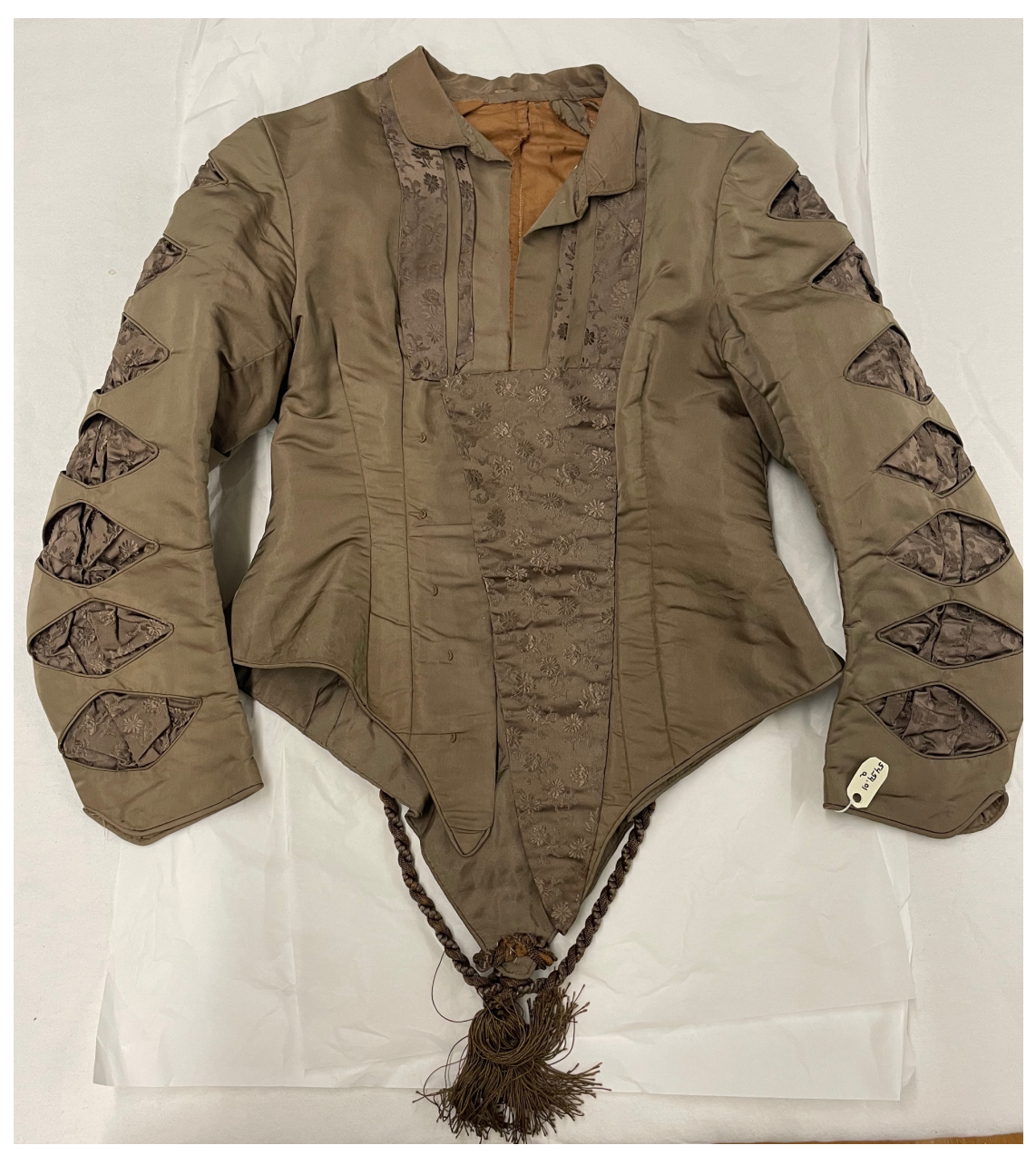
Figure 5: Front exterior of 54.54.01a bodice Notable condition issues pictured include: